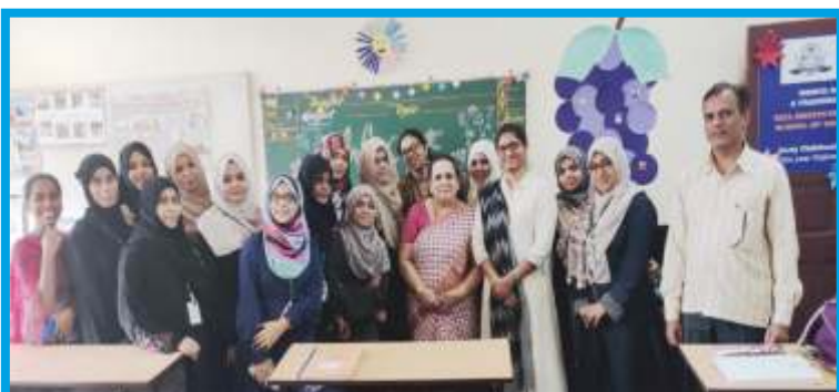
ECCEd Course Students with the Course Director and other faculty members.