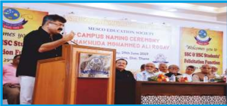
Dr. Jitendra Awhad (MLA & Cabinet Minister for Housing) addressing a gathering during the Campus Naming Ceremony of the New School Plot.