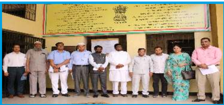
Representatives of Islamic Development Bank (Western India Region) visited Crescent English High School & Jr. College.