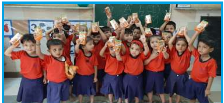
Nursery School Students enjoying Dabur Energy Drinks, sponsored by M/s. Dabur under CSR