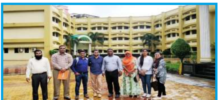
A CSR Team of M/s. Nadiadwala Grandson Entertainment Pvt. Ltd. visited Crescent English High School & Jr. College.