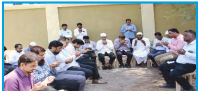
Prayers were offered for the Construction of the New School Building.