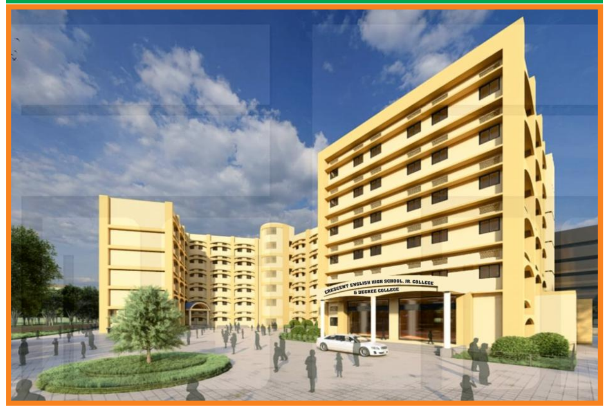
Proposed elevation after the addition of three more floorswww.mescoeducationsociety.org

Together, Let's Expand Our School to Meet Today's Needs and Tomorrow's Dreams